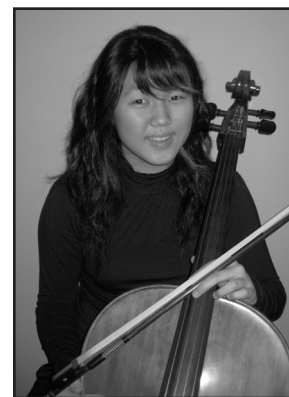
JINN SHIN CELLO CONCERTO NO. 1 - SAINT-SAËNS

ADMISSION: $10.00 ADULT $8.00 SENIORS $5.00 STUDENTS CHILDREN UNDER 10 ARE FREE TICKETS ARE AVAILABLE AT THE DOOR.